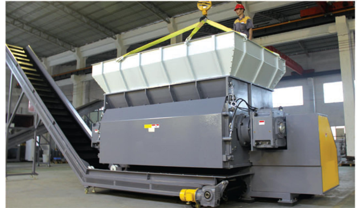
BH2800 Single shaft shredder